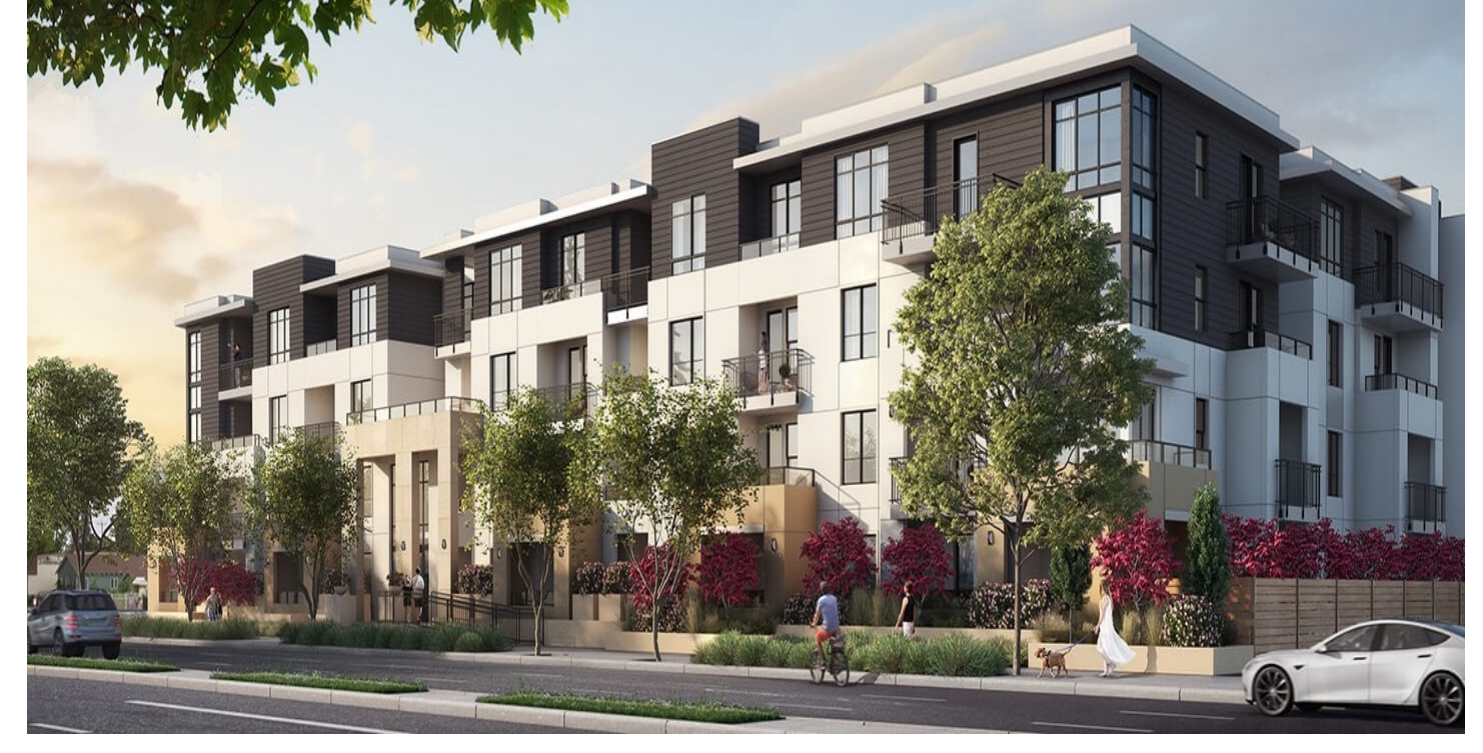
1101 West Apartments Project type: Basement 2 levels of suspended slab Total Project size: 140 Apartment Units Total CIP slabs 70,000/SF Project Address – 1101 W El Camino Real, Mountain View CA