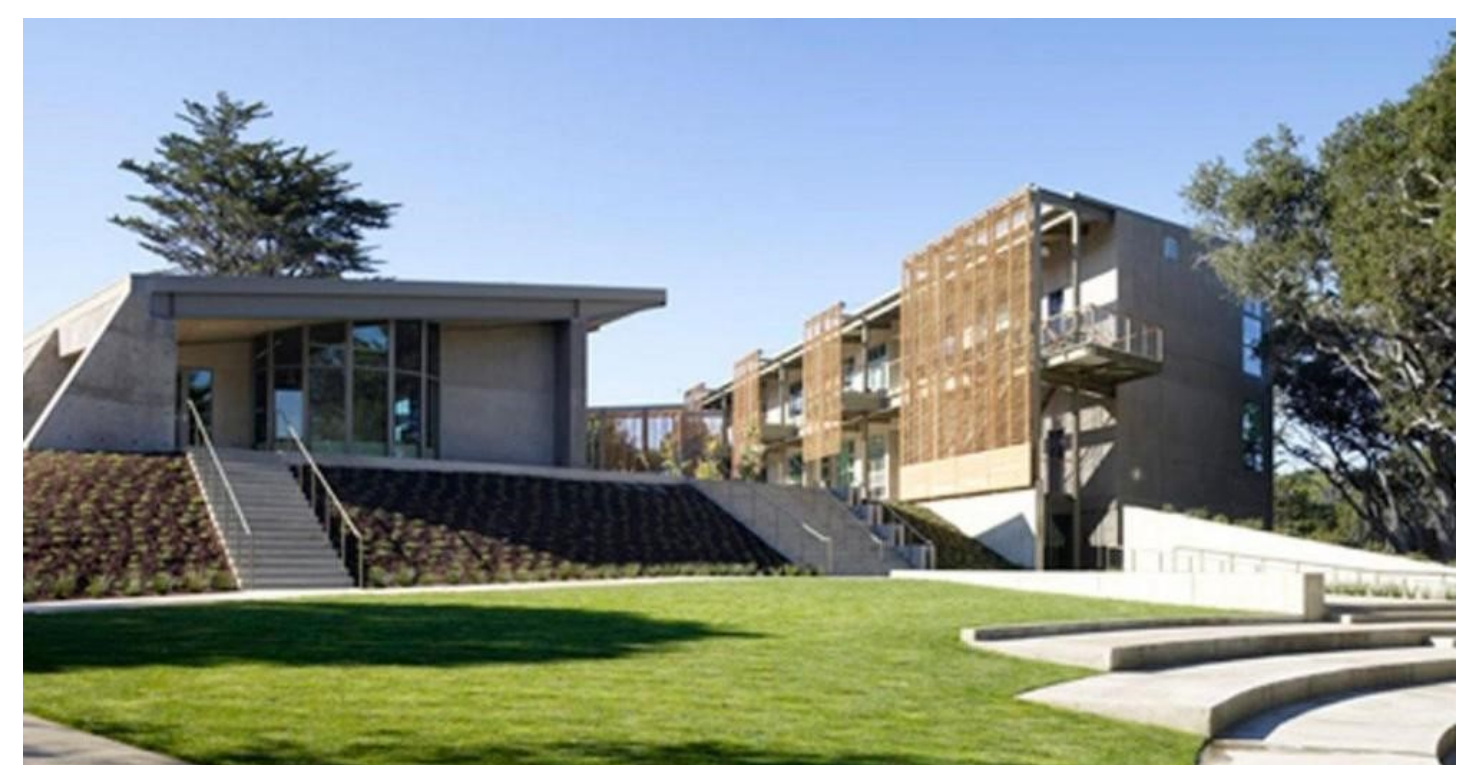
Nueva School Project type: Decorative retaining walls and major addition: Mat Slab & podium

Project type: Concrete podium slab on grade with 1 level of suspended slab Total Project size: 78 Unit + retail space Total CIP slabs 40,000 SF Project Address – 2628 Shattuck Avenue, Berkeley CA