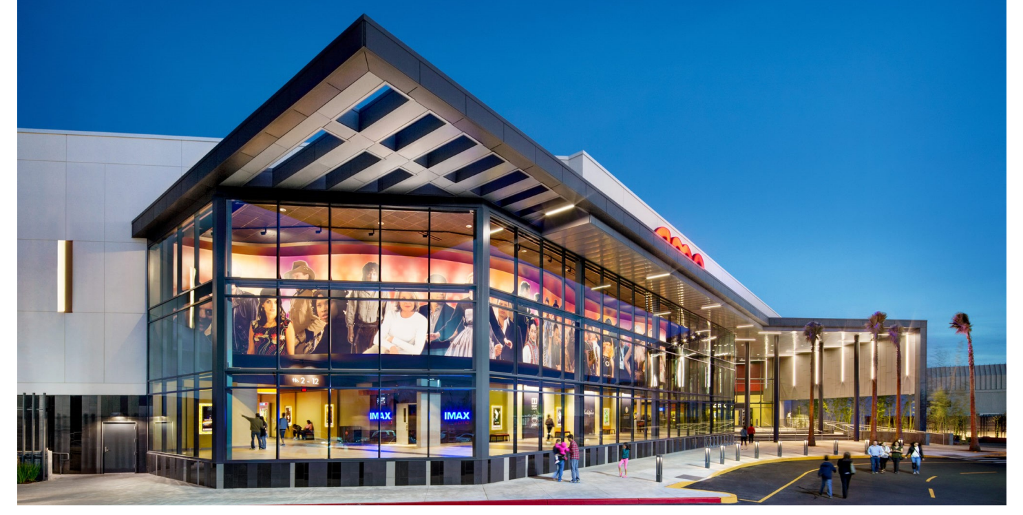
Newpark Mall: Project type: Basement retrofit, construct of new theater with multiple concrete decks. Project Address – 2086 Newpark Mall, Newark CA